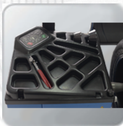
Ergonomic tool tray.