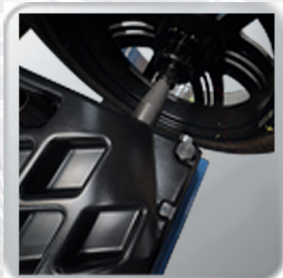
Ergonomic tool tray.