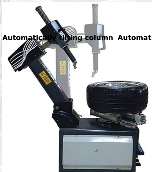
Automatically tilting column Automatic bead-breaker