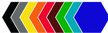
Kolory na zamówienie