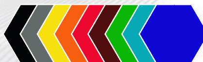
Kolory na zamówienie