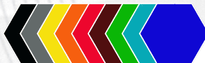
Kolory na zamówienie