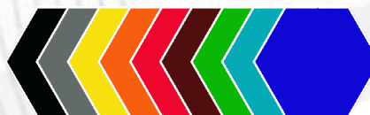
Kolory na zamówienie